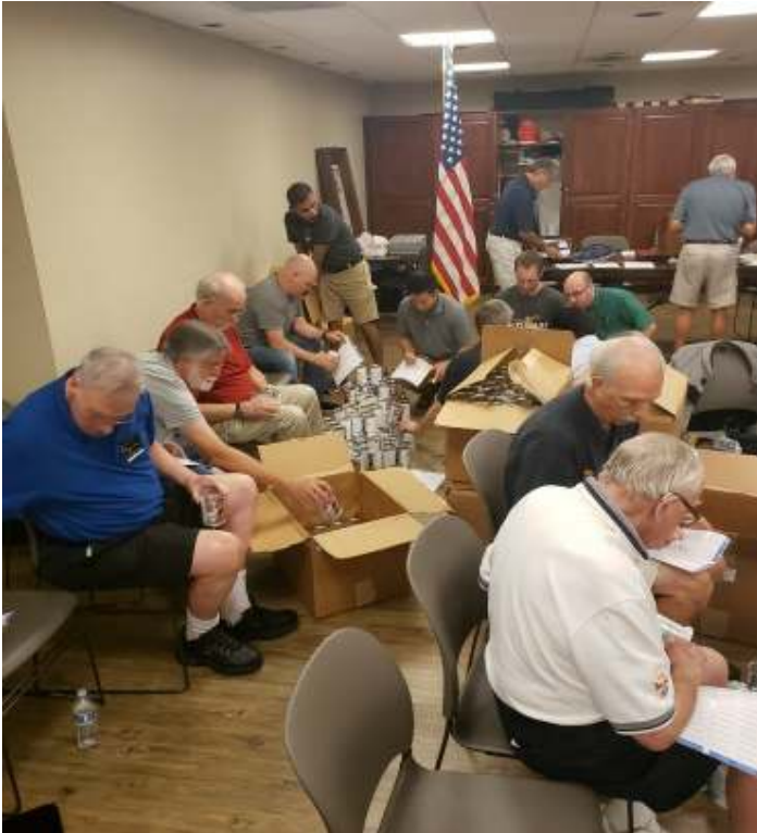
Knights preparing Baby Banks for distribution.

Several Pro-Life activities took place last month where our Council was actively participating and leading the parish, including the Pro-Life Rosary on Saturday, October 12 and the 24-hour vigil on Sunday, October 13.