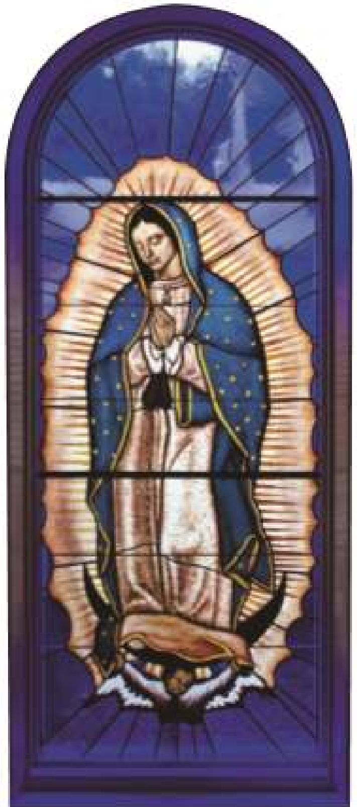
A stained glass window of the Virgin of Tepeyac at Villa Maria Guadalupe.

The Blessed Mother doesn't want any one of us to be content to do business as usual, content to be cautious, secure in excuses — rather she wants to touch our lives, deeply and personally, so that as leaders of the Knights we can be intentional disciples of her Son who in turn will advance the Church's mission of spreading the Gospel. Vivat Jesus!